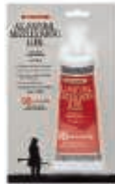
No. 6690 $9.19

Great Plains™ all-natural muzzleloading lube ensures accuracy and consistency from shot to shot and allows you to fire more rounds without having to stop and clean your barrel. It seasons the bore, inhibits rust and leaves no sticky residue. Use it as a patch lubricant or conical bullet lube.