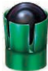
No. 6752 $10.04

Hard Balls are created with the same exacting precision as our cold-swaged round balls. You can't load this ball with a conventional cloth patch, so we designed a special plastic patch that helps them fly true to target every time; plus, they're easy to load.