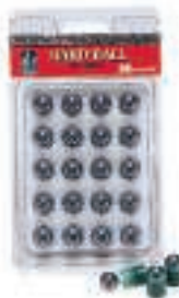
No. 6950 $9.32