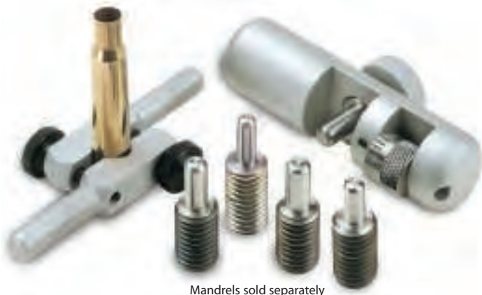
Mandrels sold separately

TURN CASES OF NEARLY ANY DIAMETER: With a wide variety of mandrels, Hornady's new neck turning tool can accept cases of virtually any diameter.