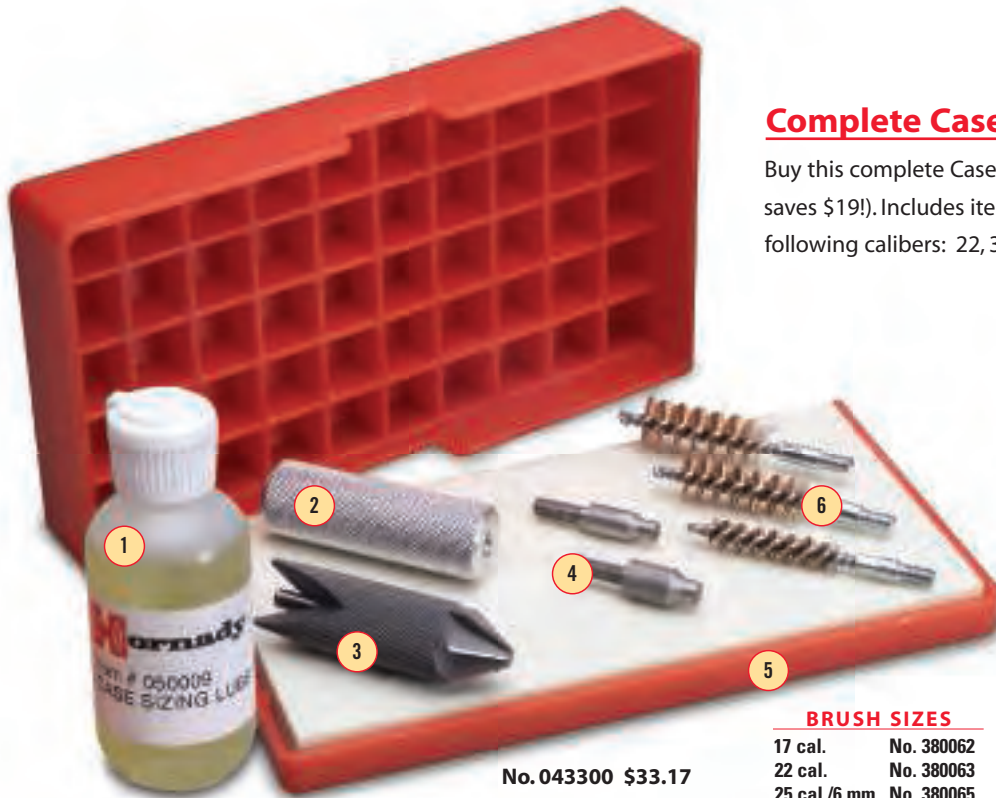
No. 043300 $33.17