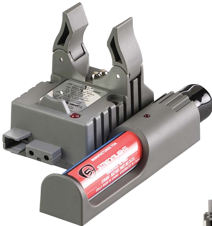
PiggyBack® charger doubles your run time by charging a spare battery so you can keep on working; reduces down time Battery sold separately

The Strion Series now has expanded charging options! The new PiggyBack charger features dual power input — via USB or “traditional” AC/DC power sources. It doubles your run time by charging your Strion and a spare battery.